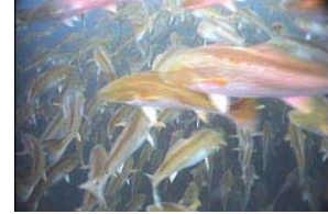
Figure 1. ROV snapshot of red drum school in the North Central Gulf of Mexico

The red drum ( Sciaenops ocellatus ) fishery in the North Central Gulf of Mexico has been defined as overfished for the latter part of the 20 th century. However, due to aggressive management of the species for the past twenty years, the stock is showing signs of recovery (Figure 1). The status of the stock is now undefined due to the lack of quantitative